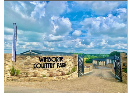
Private Gated Entrance

VIEWING STRICTLY BY APPOINTMENT WITH THE VENDORS AGENT - RIGHT CHOICE PARK & LEISURE HOMES